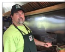
Madison Ruritan working Cafe at Caroline County Fair