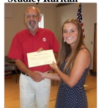
2016 Scholarship winner