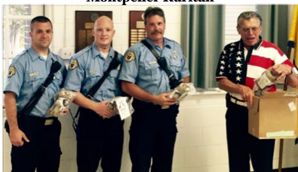
gives Rudy Bears to the local fire