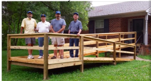
Built handicap ramp for members grandmother