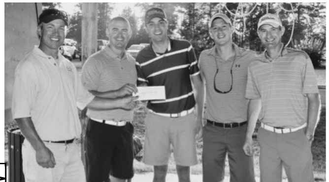
Last year's First Place Team