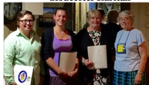
welcomes 3 new members