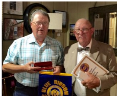
2015 Outstanding Club President Award 2015 Blue Ribbon Award