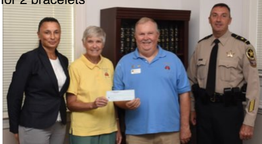
Westmoreland Sheriff Dept. accepted check for bracelets for Project Lifesaver Donation for 2 bracelets