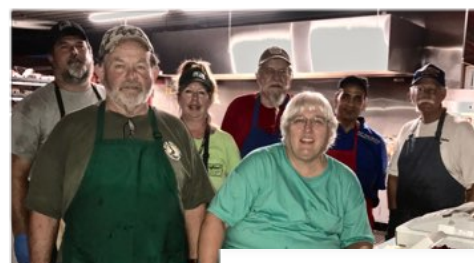
Madison Ruritan members manning the Caroline County Agricultural Fair Cafe July 12th thru the 15th